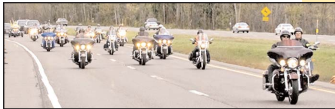
Riding three abreast on Interstate Route 81 south, prevented cars and trucks from getting in the midst of the ride, on the home stretch, north of Cicero.

see the unity and purpose of each rider. I sat on the back of the bike and looked at the long procession ahead. Some had flags or banners flying to signify their cause - The Patriot Guards and the American Legion Riders. There were the POW/MIA banners that still fly even though the war was officially over in April of 1975. No war ever waged probably ever carried such deep sadness and regret for such an extended period of time. The enormous problem and heartbreak of soldiers that continue to be held as prisoners or missing in action have left deep scars on the hearts and minds of fellow comrades, family and friends.