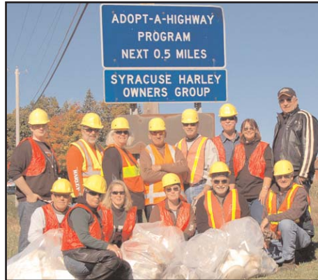
Fall Roadside Cleanup